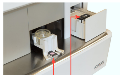
Load PHBR slide here Load slide wash here